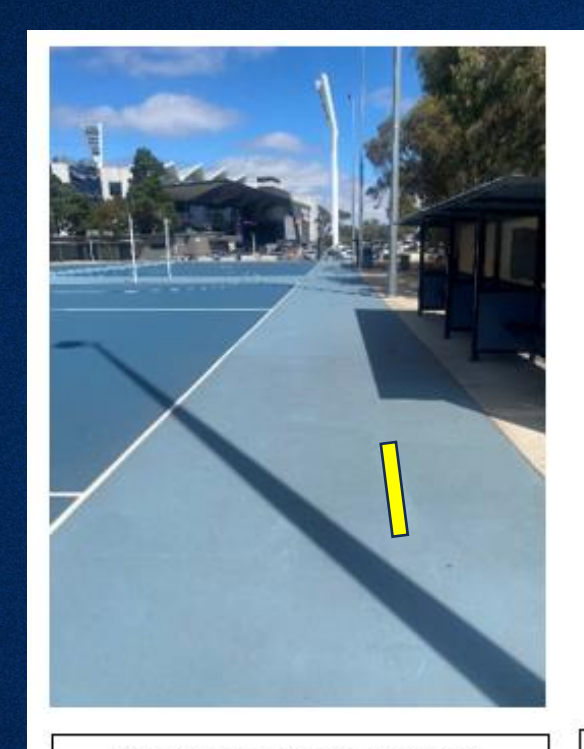
2 metres back from court line