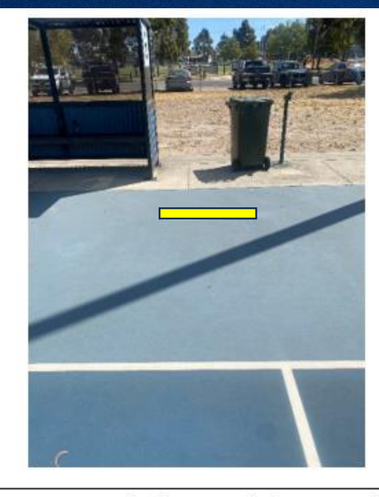
Zone just inside the centre third transverse line